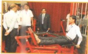
Gym & Other Activities