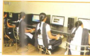
Computer Lab. with wifi